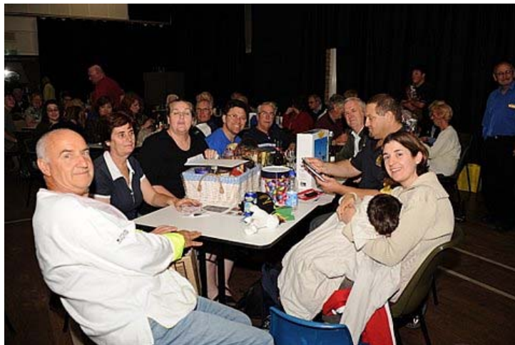
Table 3 were the winners of the evening - CONGRATULATIONS!

Congratulations to everyone who participated and showed their support for The Green Room. Here's some pictures from the evening taken by Roleystone's President Zyg Woltersdorf.